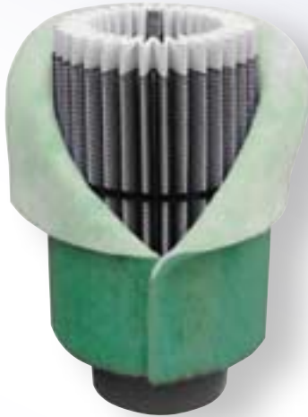
Filter element cat# 324-4610WK5 & housing cat# A10-0125-MT-080 w/hood removed. To order Filter Housings that accept accordion style filter elements go to page 17.